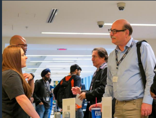
5' tables in the 2023 DMV event

Dedicated tables in sponsor expo for both tiers to engage with the community